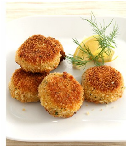
Miniature Crab Cakes